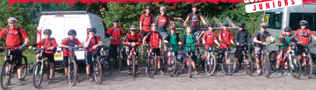
MTBG Juniors about to set off to ride Hamsterley

It is amazing to think that the junior section is barely six months old! It seems the juniors have been around for years, although the buzz and excitement oozing from the kids perhaps suggests otherwise, not that it seems that their enthusiasm will ever calm down.